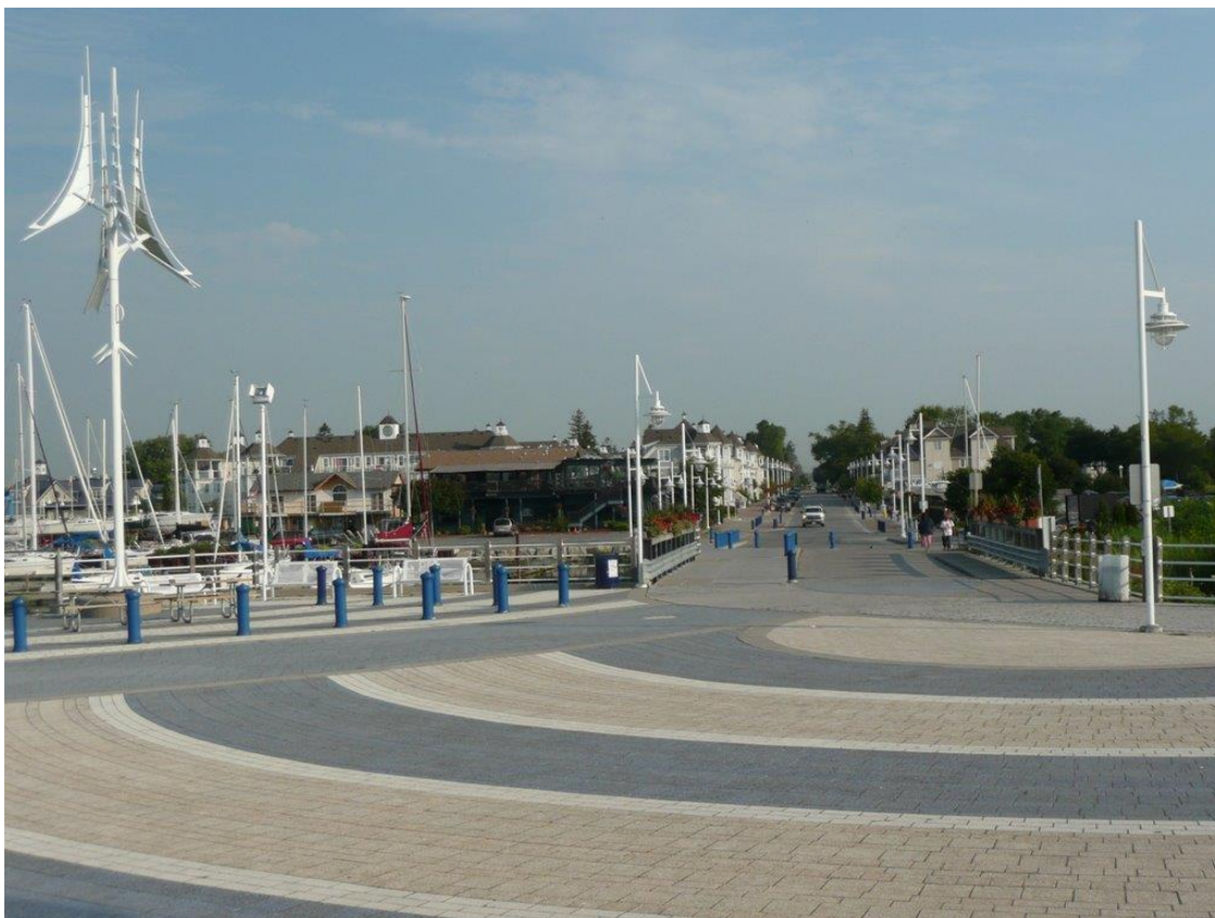
Photo of Millennium Square during the summertime.