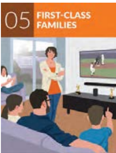
05 FIRST-CLASS FAMILIES Large, well-off suburban families