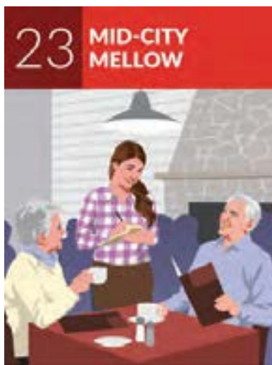
23 MID-CITY MELLOW Older and mature city homeowners