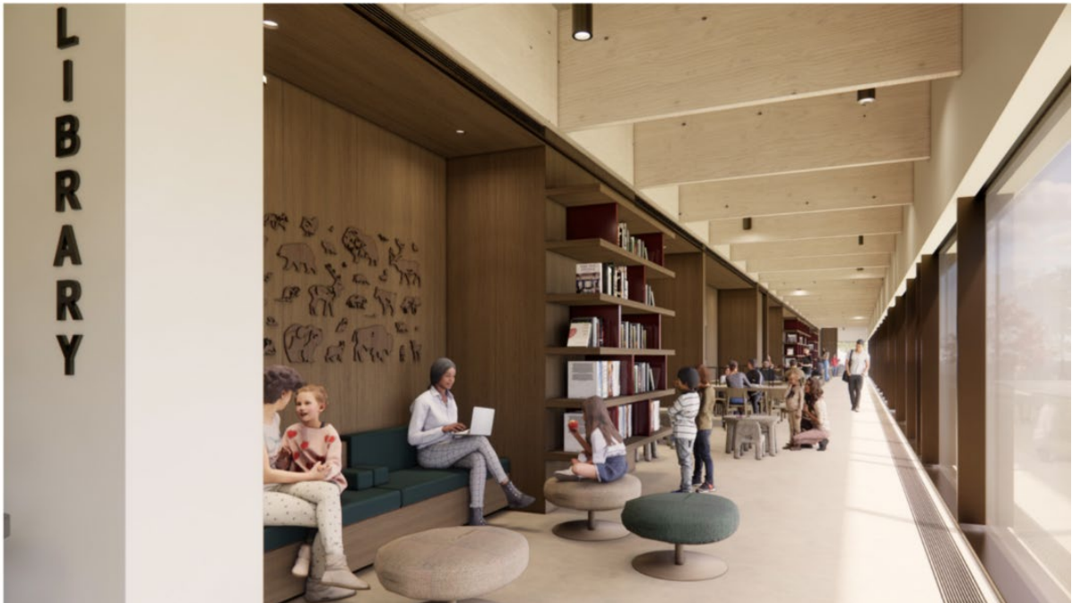
Library Alcove 1