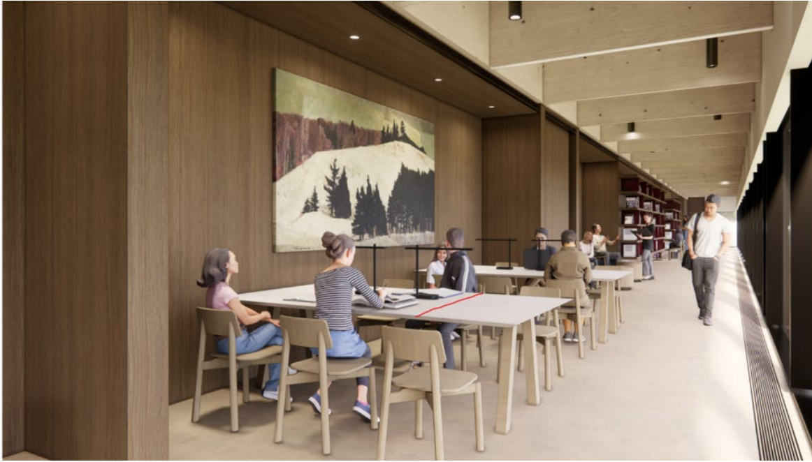
Library Alcove 3