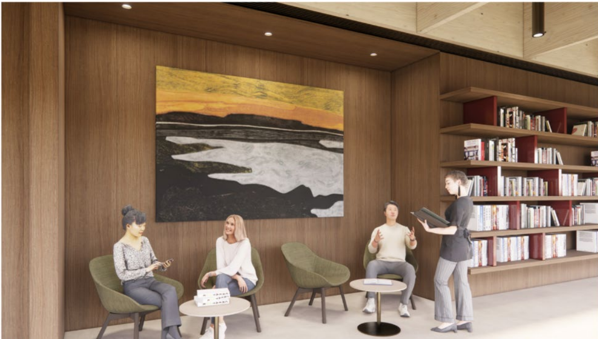
Library Alcove 4