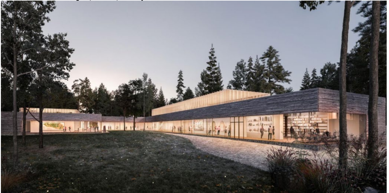
Photo of Rendering of Dorsay Community and Heritage Centre