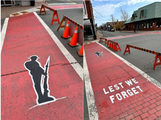
Photo of Town of Amherst “Lest We Forget Crosswalk” design by local artist Daren White.