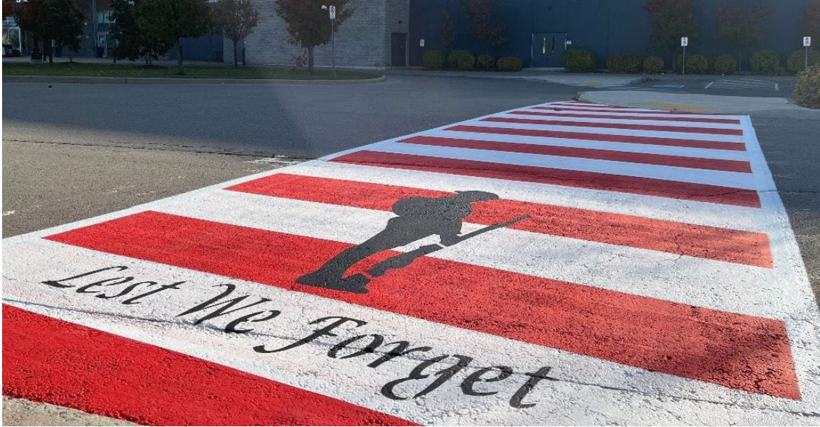
Photo of the Lest We Forget Crosswalk, located in Town of Lincoln, ON.

Deadline: February 24, 2025 at 4:00 pm EST.