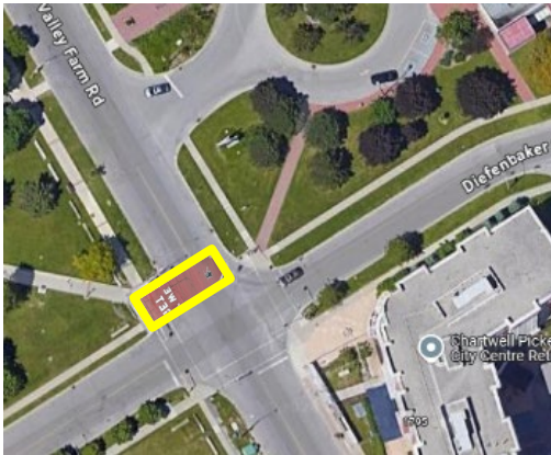
Crosswalk in City Centre will be placed near Esplanade South at Valley Farm Road intersection (north leg across Valley Farm Road)